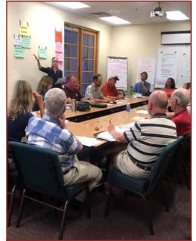
The OHV Work Group 2.0 pares down potential noise mitigation strategies.

Your expertise is welcome and valued. Sign up for a future work group at sedonaaz.gov/citizenengagement .